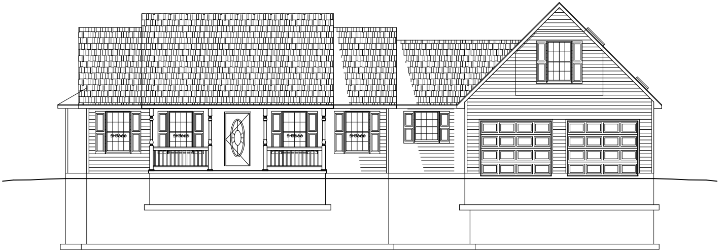
1 WEST ELEVATION A-1